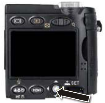
Multi - Selector

Push MODE button once and release. Then turn command dial until the F-STOP number is F7.0.